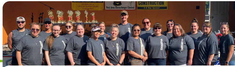
DoverPhila team members enjoying Family Day at First Town Days and presenting awards at the annual fishing derby.*

Visit dpfcu.org or scan the QR code for full event details.