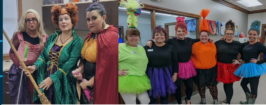
Employees dressed in their Halloween best (2023). Don't forget to dress in your best costume and join us for our annual Boo Fest*!