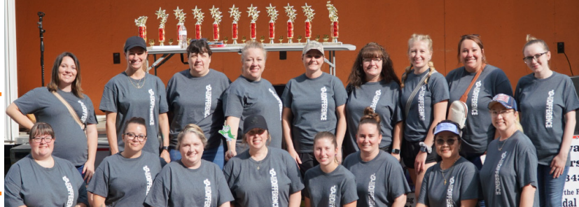
DoverPhila team members enjoying Family Day at First Town Days and presenting awards at the annual fishing derby*!