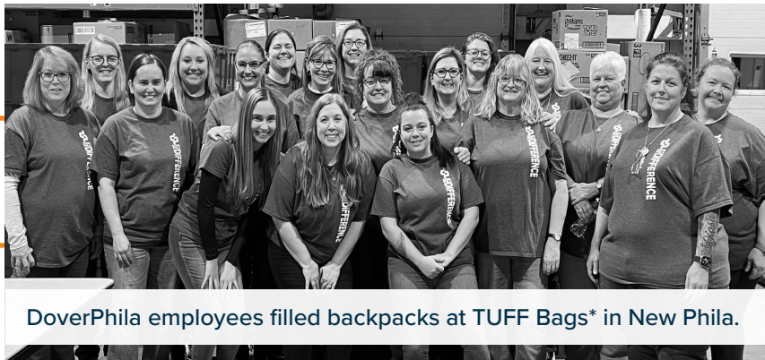
DoverPhila employees filled backpacks at TUFF Bags* in New Phila.

The second-quarter saving incentive postcard is coming your way! Be on the lookout for details on how to get a flying disc (available while supplies last).