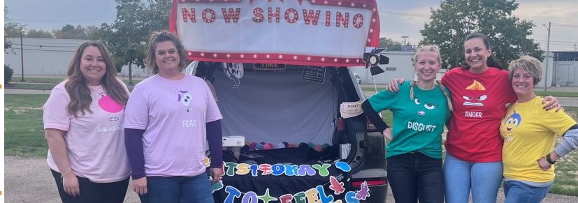
DoverPhila team members at the Credit Union's annual Boo Fest. Don't forget to join us for our annual Boo Fest*! Details below.